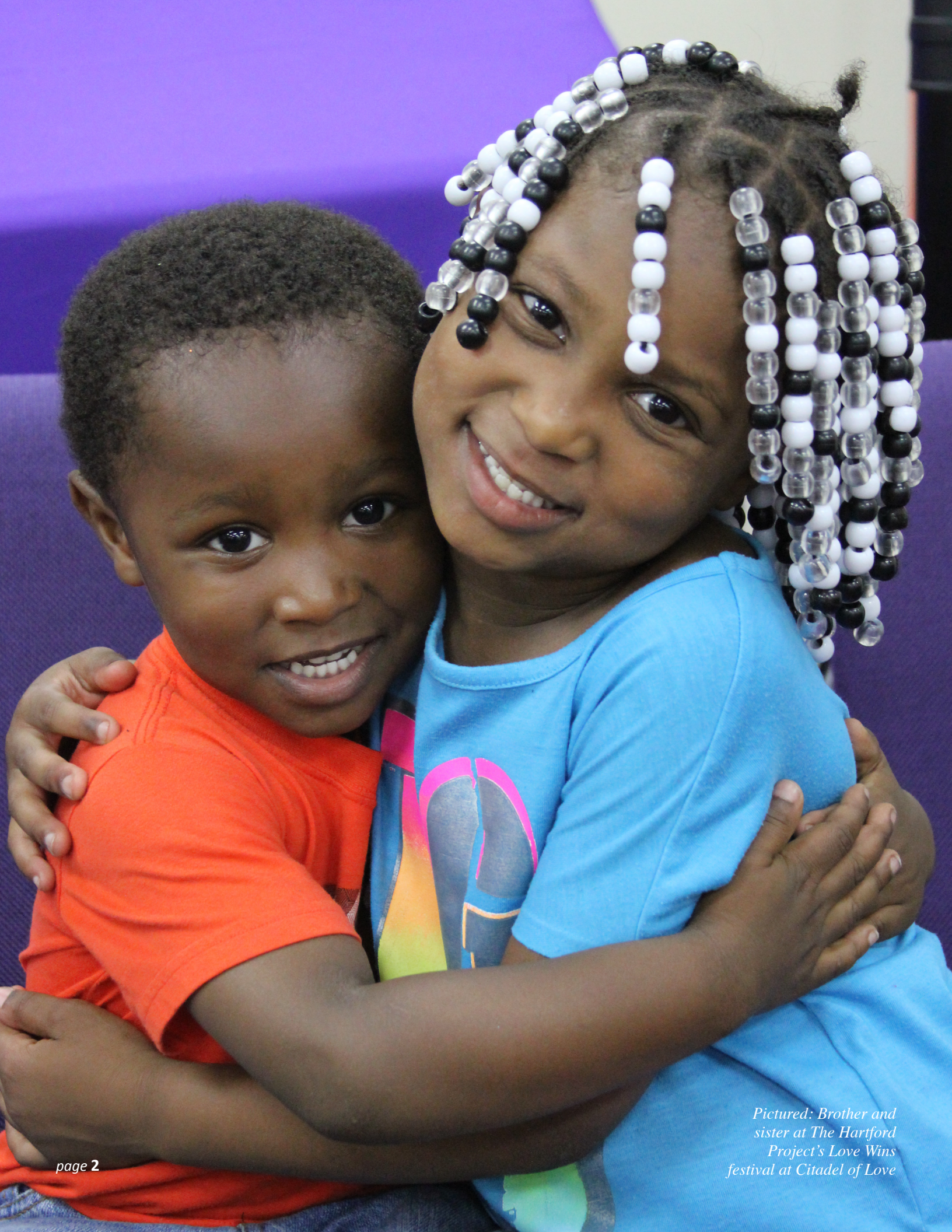
Pictured: Brother and sister at The Hartford Project's Love Wins festival at Citadel of Love